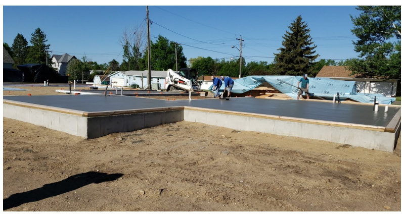
Nelson Concrete putting final touches on the concrete slab of our current twin home.

Since Habitat for Humanity Greater Watertown Region started in 1995, we have been busy not only building homes but helping families around our area start their lives in an economically efficient environment. This year is a milestone for Habitat for Humanity, as we have started to build our 30th and 31st home! We have chosen two families who are ready to start the journey of building and owning a home. We are so excited our mission is being fulfilled right her in Watertown.